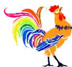
Men's Walk #1659 May 3 – 6, 2012 Camp Young Judaea