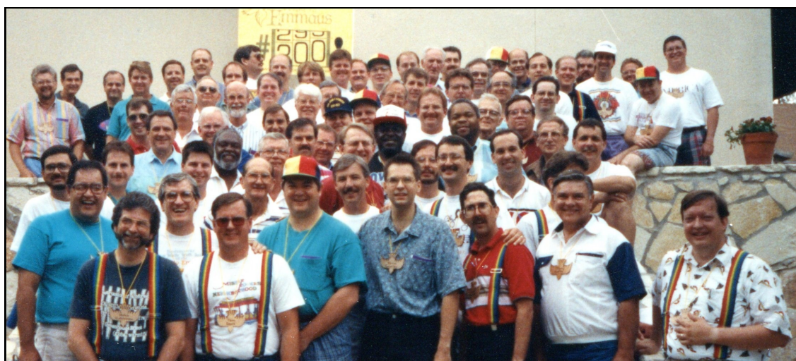
Men's Walk #300 May 27 – 30, 1993 Mt. Wesley