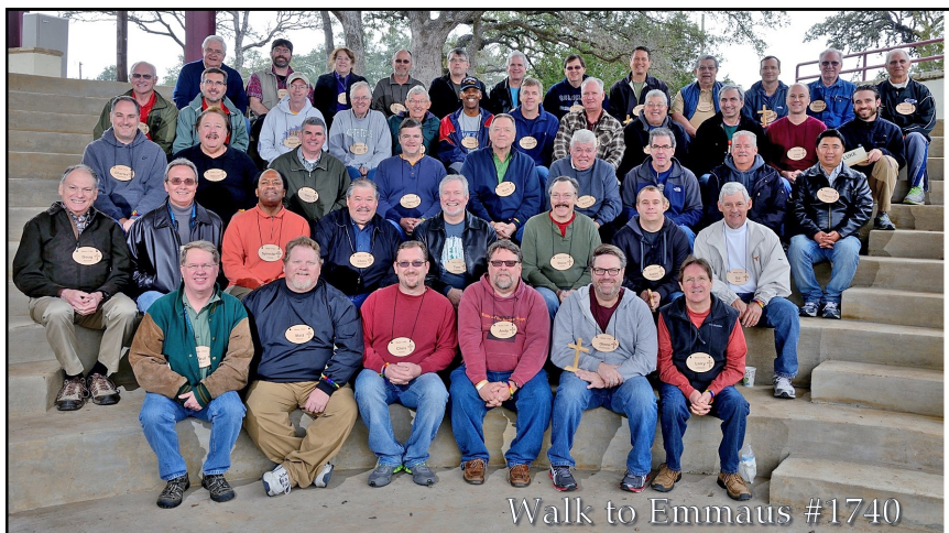
Walk to Emmaus #1740