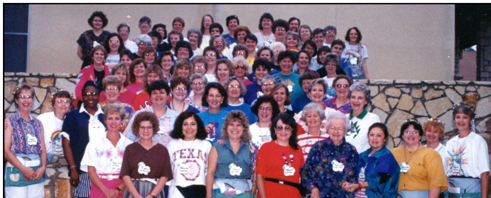
Women's Walk #372 September 8, 1994 Mt. Wesley

Below are the original pilgrim/team photos of these Walks. See anyone you recognize? If you were a pilgrim or team member on one of these Walks, come to the May 12 th Gathering at Northwest Hills UMC to be reunited!