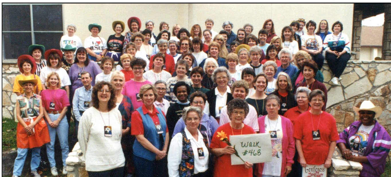
Women's Walk #468 November 9, 1995 Mt. Wesley

Below and on the next page are the original pilgrim/team photos of these Walks. See anyone you recognize? If you were a pilgrim or team member on one of these Walks, come to the December 1 st Gathering at Cedar Creek UMC to be reunited!