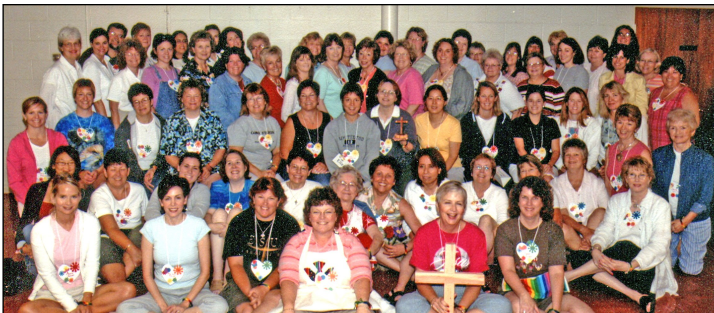
Women's Walk #1161 July 29, 2004 Omega Center