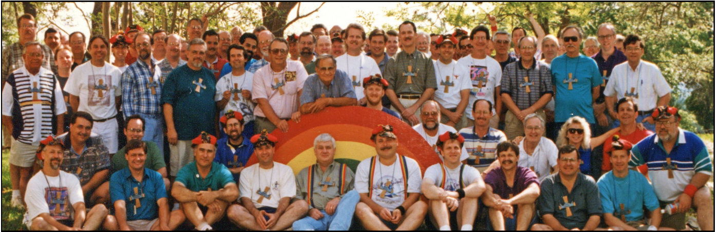
Men's Walk #504 May 16, 1996 Omega Center

Below and on the next page are the original pilgrim/team photos of these Walks. See anyone you recognize? If you were a pilgrim or team member on one of these Walks, come to the February 2 nd Gathering at Oak Hill UMC to be reunited!